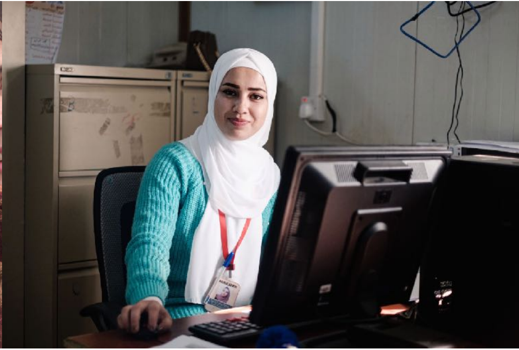
Help them sign up for benefits, doctors, dentists etc.