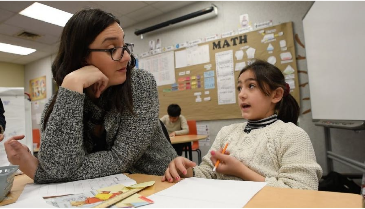
Assist with ESOL classes and general language skills