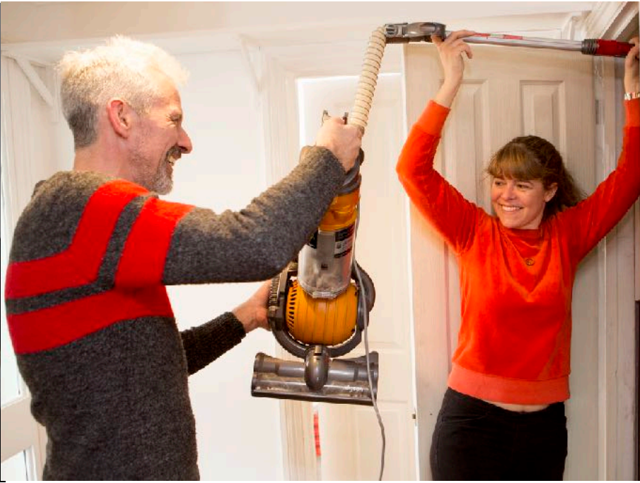
Secure a house for at least 2 years