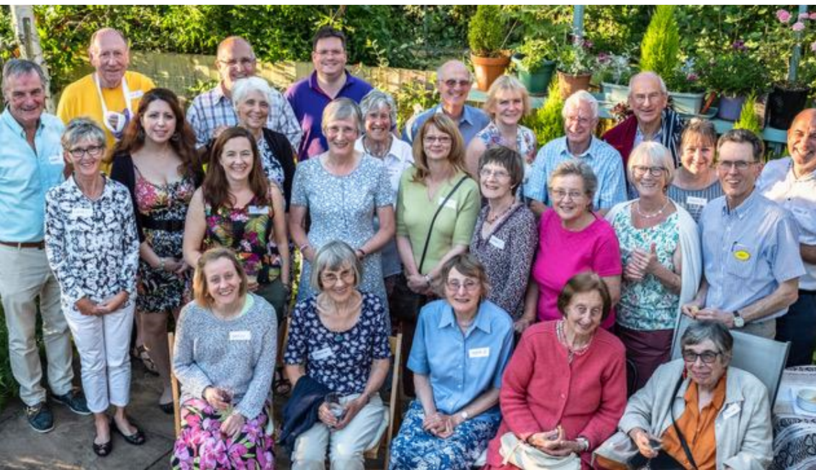
Form a core group and find volunteers to help