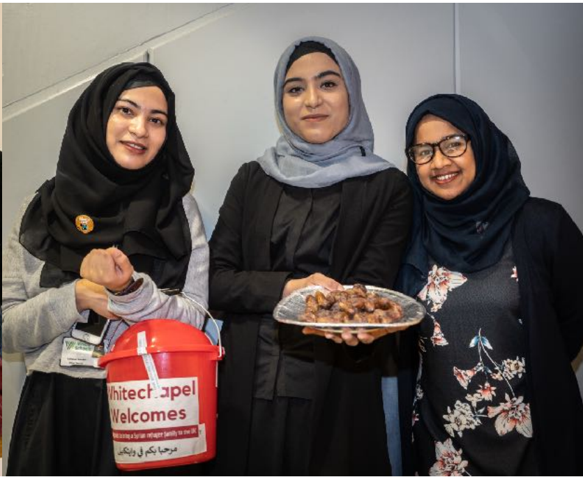
Fundraise a minimum of £9,000