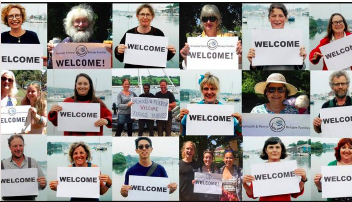
Welcome a refugee family to your neighbourhood