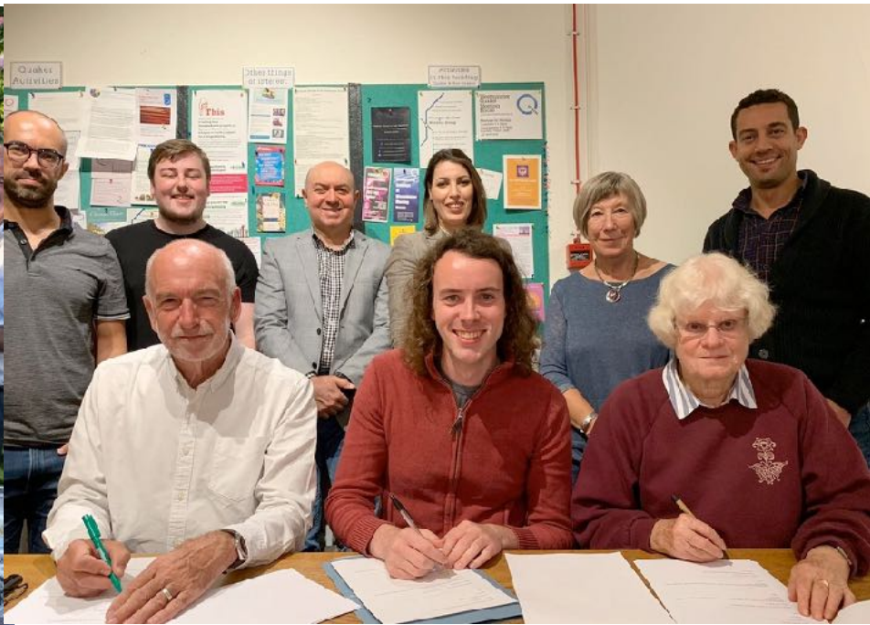
Prepare and submit applications to your local council and the Home Office