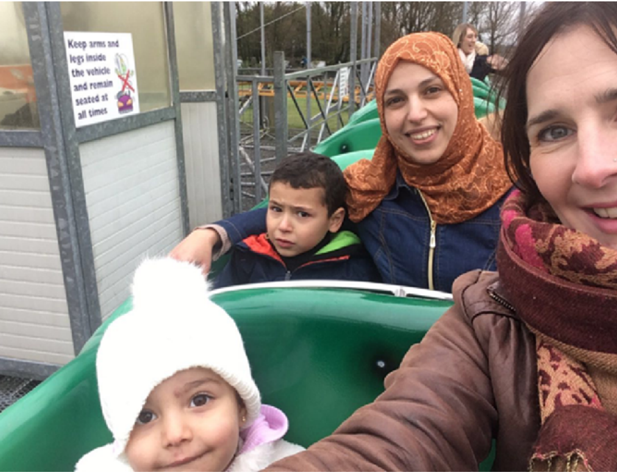
Show them around the local neighbourhood