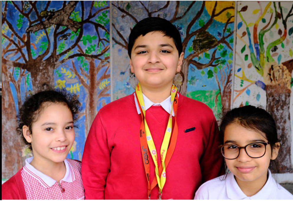
Enrol the children in a local school