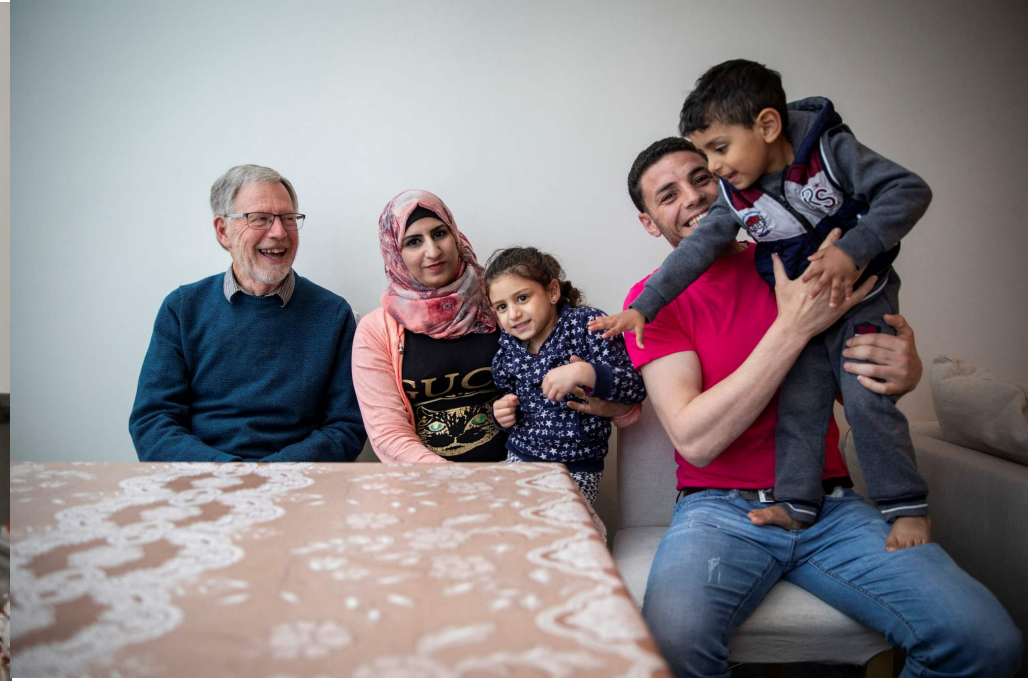
Enjoy the incredible times ahead